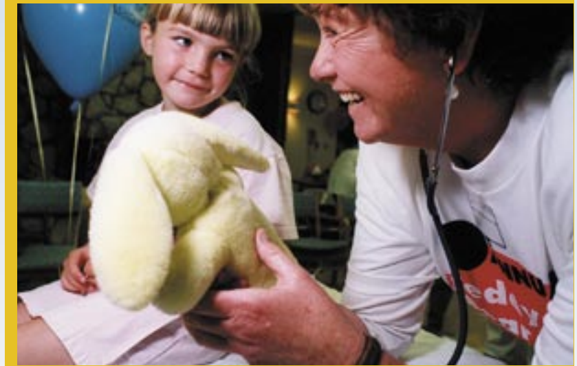
The purpose of the annual Teddy Bear Clinic is to introduce children to the hospital environment in a way that is friendly and nonthreatening.

Last July, Seton Coastside was honored by SAMCEDA, the "voice of business on the peninsula," for its positive business practices and environmentally friendly actions.