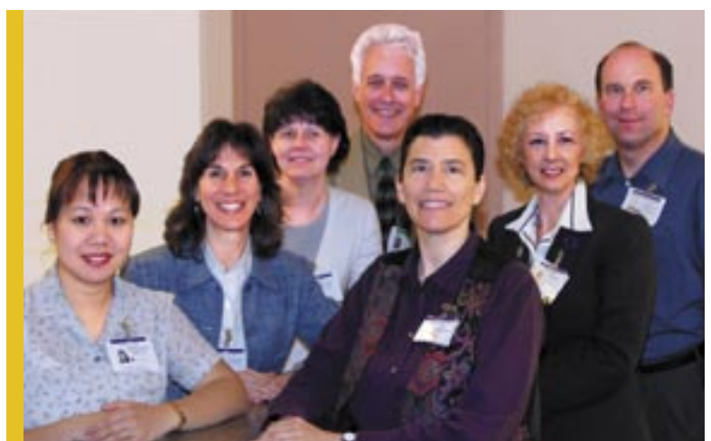
The experienced team of professionals at Seton's Outpatient Mental Health Program treats patients with empathy and compassion.

Seton's Partial Hospitalization Program treats patients suffering from such illnesses as major depression, bipolar disorder, anxiety disorders, and schizophrenia. Many patients have suffered alone in isolation, others are suicidal, paranoid, or have delusional (nonreality based) thoughts. Some have difficulty concentrating or organizing their thoughts. Some enter the